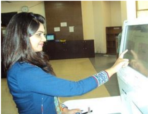
RFID Based Self Check Machine

The library consists of six floors with over 70,000 sq.ft. area at the south-east side of the NSU campus at Bashundhara, Dhaka. It can accommodate over 1,200 students at a time in its well-furnished reading rooms. On an average 2,000 users use the library every day.