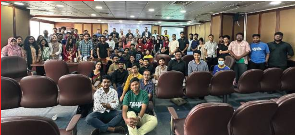
The Center for Legal Research at the Department of Law, NSU, organized a seminar titled, "Judicial Accountability and Independence"

Presented a paper titled, "Rethinking Treaty Compliance from the Periphery: Bangladesh, the Hong Kong Convention, and the Asymmetries of International Environmental Law" at the NSU Law Faculty Seminar