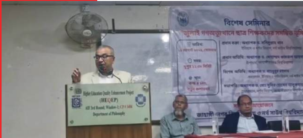
Department of History and Philosophy at NSU in collaboration with Jahangirnagar University, organized a seminar titled, “The Combined Role of Students and Teachers in the July Uprising.”