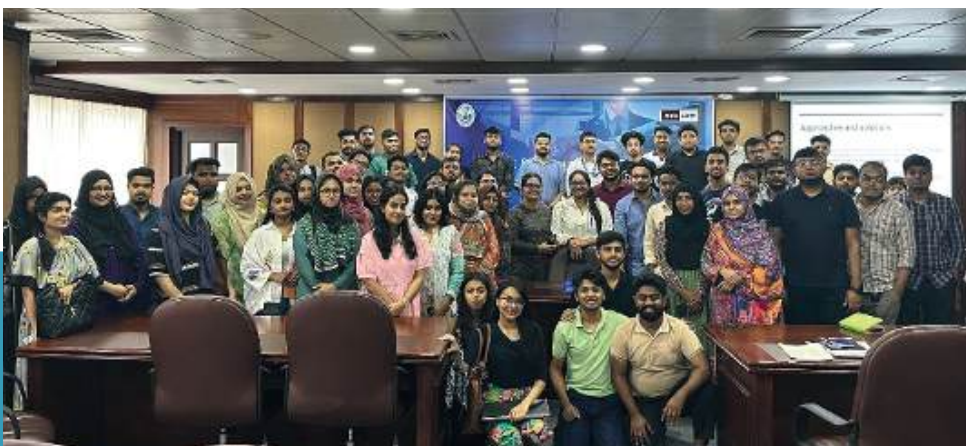
The Department of Law, NSU successfully hosted Episode 04 of its Business Law Talk series, featuring a special lecture on "Corporate Crimes"