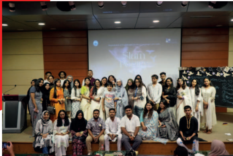
Department of English & Modern Languages hosted the event titled, "Slam Poetry: Porbo Dui".

Participated as a panelist at the panel discussion titled, " La Luta Literaria: Ngugi and the Battle for Language and Liberation " at ULAB