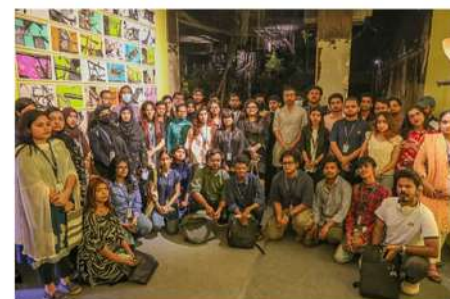
প্রদর্শনী দেখতে আজ দুপুর সাড়ে ১২টার পর প্রথম আলোর অধিদপ্তর ভবনে এসেছিলেন বেসরকারি নর্থ সাউথ বিশ্ববিদ্যালয়ের মিডিয়া, কমিউনিকেশন অ্যান্ড জার্নালিজম প্রোগ্রামের একদল শিক্ষার্থী।

Department of Media, Communication, and Journalism (DMCJ), visited the premises of Prothom Alo in Kawran Bazar, as part of an academic engagement focused on contemporary media issues and professional practice.