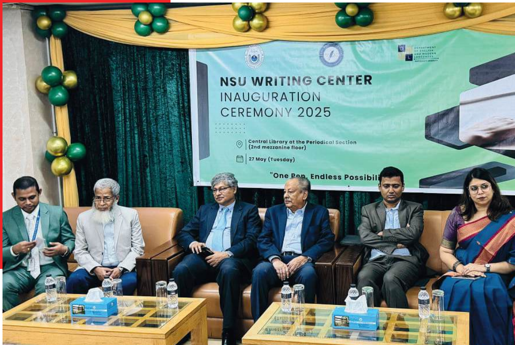
North South University marked a milestone with the inauguration of the NSU Writing Center by The Department of English Modern Languages, NSU.

Participated as a discussant in a book talk titled, "Bridging the Divide: Digital Inequalities in Media Educa- tion in South Asia" organized by Daffodil International University