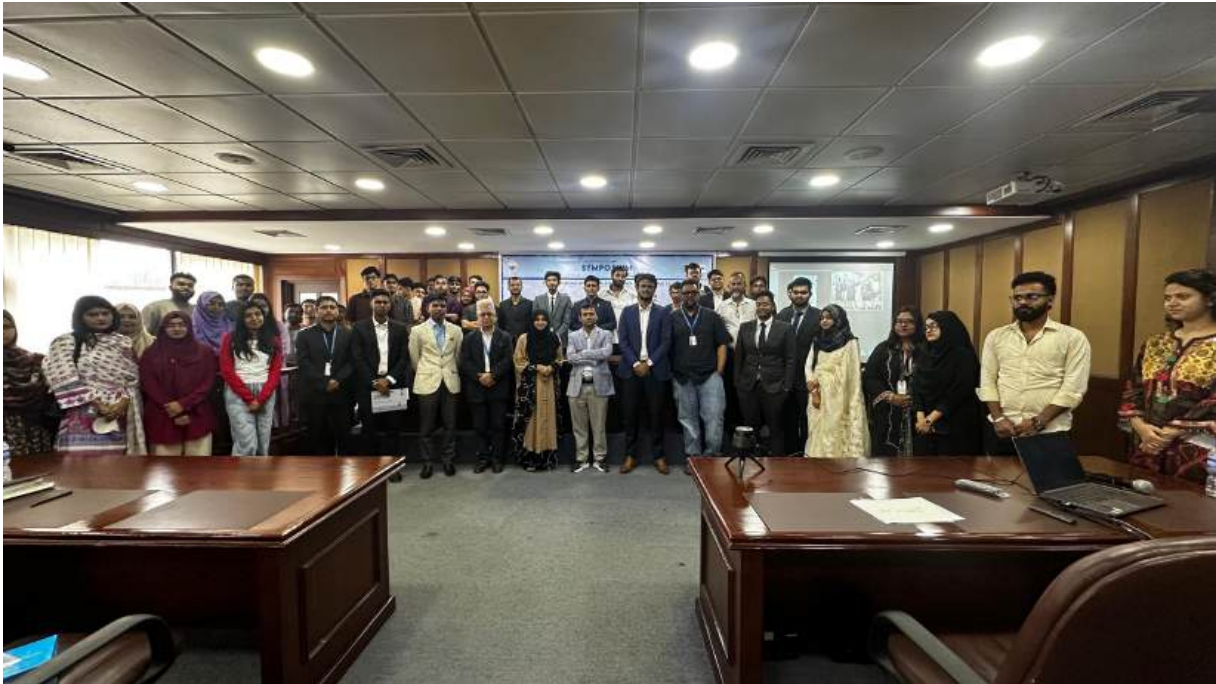
The Department of Law, NSU successfully held the final paper presentation of the Undergraduate Law Symposium Spring 2025.