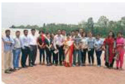
MPPG 4th Batch Parliament Visit 2015