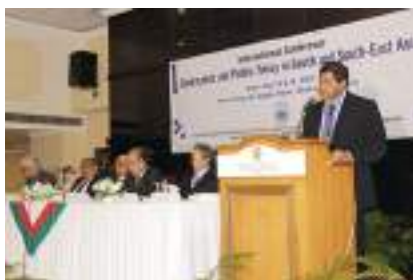
PPG International Conference 2012