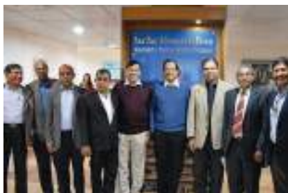
Faculty from Norway, Bangladesh, Sri Lanka & Nepal