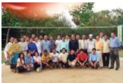
MPPG 2nd Batch at BARD Visit 2010