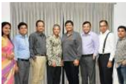
PPG Faculty and Staff