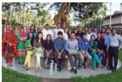
MPPG 6th Batch at BARD Premise 2016