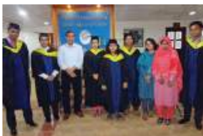
MPPG 3rd Batch Convocation 2012