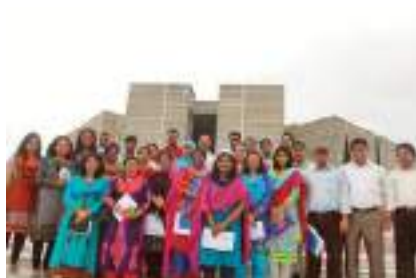
Participants of Executive Certificate Course at Parliament Visit 2013