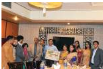
MPPG 4th Batch Farewell 2015