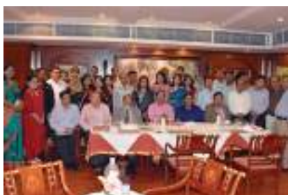
MPPG Alumni Dinner 2015