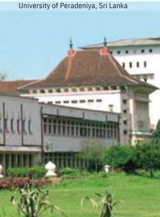
University of Peradeniya, Sri Lanka