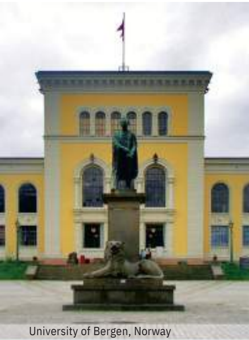
University of Bergen, Norway