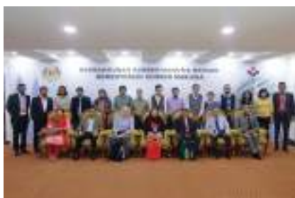
MPPG 4th Batch at Malaysia Visit 2015