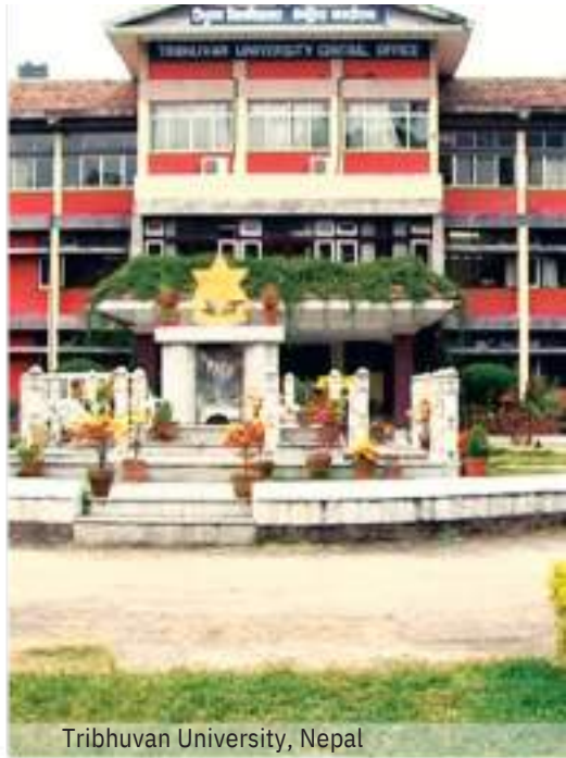
Tribhuvan University, Nepal