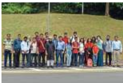
MPPG 5th Batch at National University of Singapore 2016