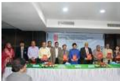
PPG Book Launching Ceremony 2016