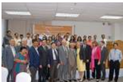
MPPG 1st Batch Orientation Ceremony 2008