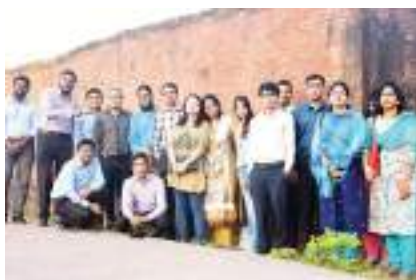
MPPG 5th Batch at Field Visit in Comilla 2015